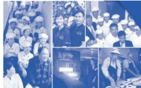
Ngan- Vietnam's Social Enterprises