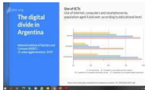
Agustina- The digital point: a public initiative on Digital Inclusion